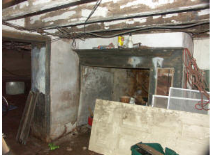
Photo 31. Kitchen hearth in basement of north section, facing north.

door from the north section opens east of the hearth support (B), a large stucco over stone element consisting of piers supporting a stone arch below the original kitchen fireplace on the first floor. The portion of the hearth support facing the door has the “Hunsicker 1834” inscription (Photo 33). The western half of the hearth support’s arch has been removed (Photo 32) for an oil chimney made of brick (C), although the springstones for the arch remain in place. A furnace used to heat the house sat on a 2’x3’ cement pad and was vented through this brick chimney.