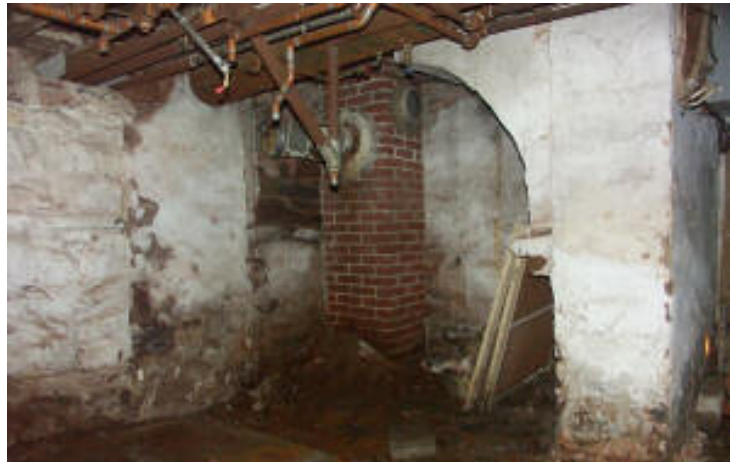
Photo 32. Altered fireplace hearth support in center section, showing the 20 th century brick oil furnace flue.

A stone wall extends south through the center of the basement of the center section. This stuccoed element appears to consist of a former freestanding pier at its southern terminus which has been extended to the north and abuts the south end of the western wall of the hearth support. [It has been suggested that it was part of the foundation of an earlier building on the location, but there is no evidence to support this argument.] A former passageway (F) between the pier and the hearth support, leading into the northwest room, was filled in, possibly using the stone removed from the hearth support.