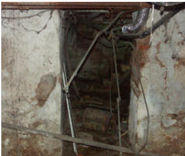
Photo 34. Entrance into connection, facing

under the south section. This area is also visible through a small door on the east wall. The joists in the south section are in excellent condition; they appear to have replaced the original joists and floor system. What appears to be a hearth support (I) is located in the southeastern corner; when the chimney was removed, the stone was placed inside the hearth support, filling the space. Today an ash cleanout remains in this area, making evident that the original hearth was converted to a smaller coal stove unit probably when the floor was replaced.