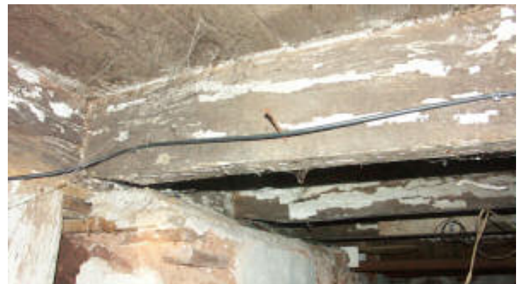
Photo 32a. Shaped joists rest on a sill plate on the top of the stone partition wall in the basement.

The original pier supported the center of the summer beam. Today, the northern half of the summer beam rests on the top of the stone wall. The thirteen exposed joists forming the ceiling of the basement of the center section are connected into the summer beam by a mortise and tenon joint. Several of these joists are chamfered at their intersection with the summer beam to accommodate a sill plate on the top of the stone wall.