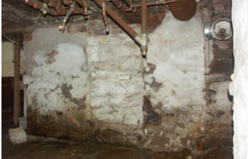
Photo 32b. Stone wall in basement of center section, showing the three sections south of the hearth support.

East of the bulkhead passageway is a doorway on the east wall leading into the basement of the connection (Photo 34). The basement under the connection measures 7'7" wide. Stairs along the east wall lead to the first floor, although markings on the walls indicate that the stairs formerly ran in the other direction (possibly when the flooring was replaced). A small window in the south wall near the southwestern corner (H) allows a view into the unexcavated area