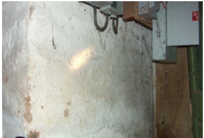
Photo 33. Markings on side of hearth support, reading "Hunsicker."