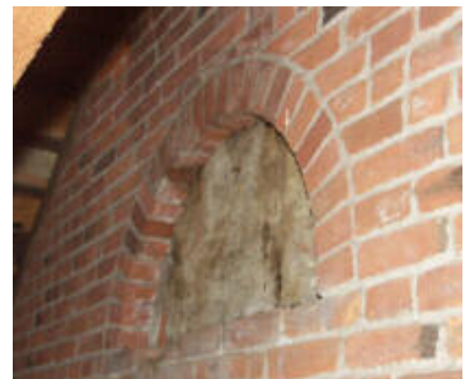
Photo 30. Datestone area, north wall of center section, visible in attic of north section. Note exterior pointing of brick.

The attic flooring in the center section consists of wide tongue and grooved planks with a butt joint aligned with the stairwell. In the north section, the flooring is slightly narrower tongue and grooved planks, but the joints are staggered throughout the flooring rather than having a butt joint down the center of the room. Two separate staircases lead down to the second floor, and each stair is part of a stair system that continues to the basement.