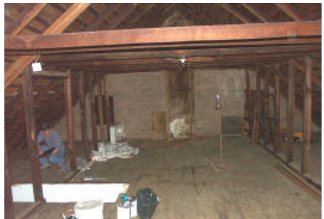
Photo 29. Interior of attic, center section.

The attic has three gable walls: the two brick gables of the center section and the stone wall of the north section. An examination of the north gable of the center section provides several clues that it was originally an exterior element. The north side of the wall has exterior mortar between the brick and a semi-circular datestone area. An iron tie rod has an S-shaped iron head and is located below the location of the datestone (Photo 30); the datestone is missing. The garret windows on the end walls are 4-light units hinged on one jamb. The attic windows on the two end walls of the center section are not aligned, although the attic windows in the north section are aligned with those of the north wall of the center section. Although the attic windows are quite old, they do not appear to be original to the sections.