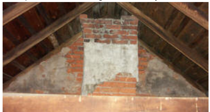
Photo 28. Chimney, south end of main block.

The rafters are attached at the ridge with a technique called the “tongue and fork” joint, an eighteenth century means of construction. Rather than having a ridge board, the upper ends of the rafters are pegged together (see Figure 5). The center section has thirteen rafters, while the north section has seven. Most rafters are braced by collar beams; two of the collar beams have been removed from the center section. This rafter and collar beam system is joined with square pegs. In the latter nineteenth century, possibly when a slate roof was installed, a set of posts was installed to support the joint