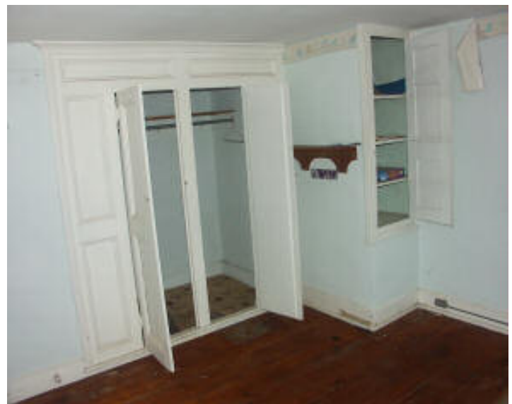
Photo 25. West wall of Room C5, showing two cabinets. The cabinet to the right has the only original door of the entire center section.

been divided into a bedroom (Room N4) and a bathroom. Room N3 has the remnants of the chimney on the north wall (Photo 23). [Note: The mass extends to the attic; as such, it appears that the second floor joists and wall are supporting this remaining chimney mass. If this is the case, the chimney mass may be structurally unsound.] Since much of the framing has been removed from around the chimney, the summer beam supporting the attic joists is partially visible; it has vertical adze marks, an indication of the age of the beam. The wall surface between the chimney and the door leading into Room N4 has vertical lathe to accommodate shelving (lathe was usually installed horizontally). A cabinet is located on the west wall between the two doors