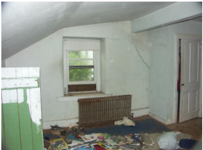
Photo 27. Room S2, facing west. Note the slope of the ceiling, which is attached to the bottom of the rafters.