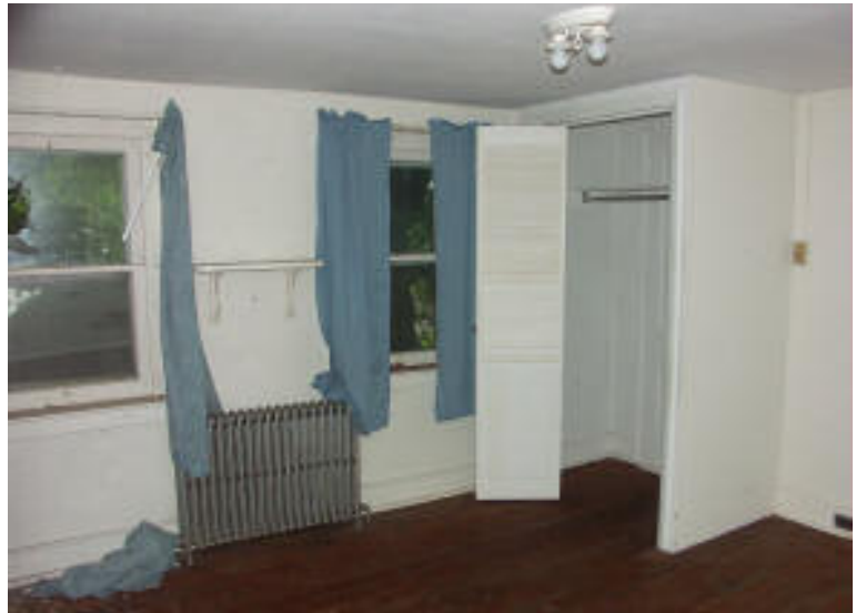
Photo 26. Room C6, center section, facing NW.

The south apartment unit consists of the room in the south section and the southeastern room in the center section. The stairs from the first floor lead up along the eastern wall of the south section into a hallway running along the northern wall of the connection. A door on the south side of the hallway leads into Room S2 (Photo 27). This room was formerly the loft or attic of the section. The ceiling is formed by the plasterwork attached to the bottom of the rafters and is therefore angled. This room has a closet in its northwestern corner and an attic-like storage area along the southern edge. The hallway has a doorway leading up one step into Room C8 in the southeastern corner of the center section. This room has a partitioned bathroom in its northeastern corner and an open closet along its western wall. Part of the chimney mass is visible on the south wall. This chimney mass is not supported on the first floor and should be examined by a structural engineer to determine its safety. A door on the north wall opens into a small storage alcove off the center hallway in the center section (mentioned above).