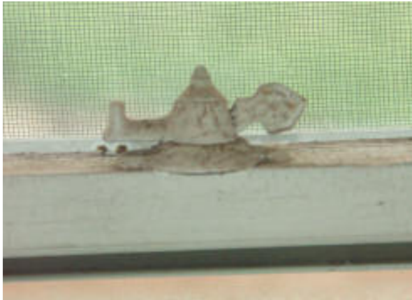
Photo 24. Victorian window latch in Room N4.

The northern apartment unit encompasses the rooms in the north section. This area is accessed from the stairs from the first floor. Room N3, measuring 10'7"x15'7", occupies the eastern portion of the north section, and the western portion has