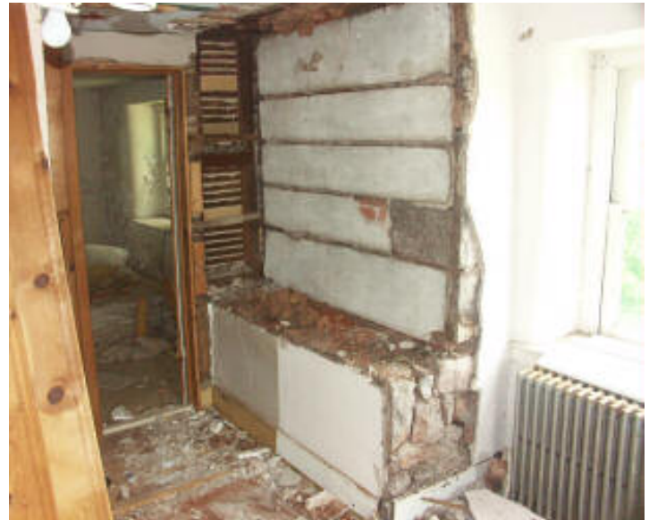
Photo 23. Remnants of chimney mass in Room N3.

been divided into a bedroom (Room N4) and a bathroom. Room N3 has the remnants of the chimney on the north wall (Photo 23). [Note: The mass extends to the attic; as such, it appears that the second floor joists and wall are supporting this remaining chimney mass. If this is the case, the chimney mass may be structurally unsound.] Since much of the framing has been removed from around the chimney, the summer beam supporting the attic joists is partially visible; it has vertical adze marks, an indication of the age of the beam. The wall surface between the chimney and the door leading into Room N4 has vertical lathe to accommodate shelving (lathe was usually installed horizontally). A cabinet is located on the west wall between the two doors