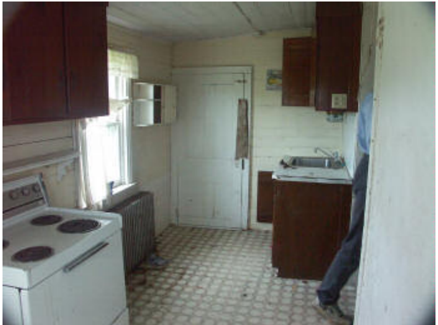
Photo 15. Kitchen in frame section, facing south.

The interior of the frame section (Room F1) consists of a single room (a kitchen) is the interior of the frame section; which the enclosed porch section attached to the east wall of the north addition. Its longest dimensions are 15'x9'. It is accessed from the north section's original exterior door, a door from the small porch on the north end of the north section, and a door opening from the porch on the east elevation. The ceiling and walls are composed of beaded siding, and the floor is covered with vinyl. A sink is located along the western wall, and other kitchen appliances are located along the eastern wall.