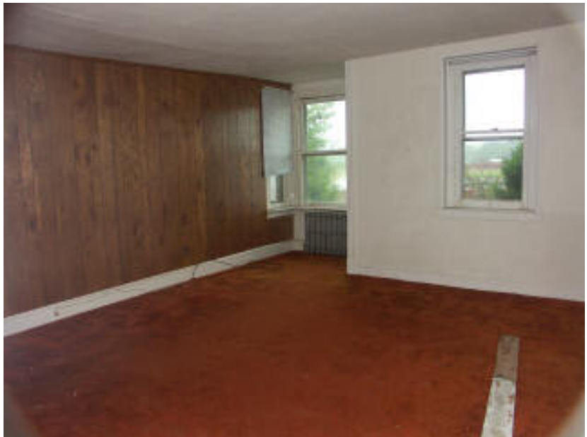
Photo 20. Room C3 in center section, facing SE. Note the bay window on the south wall.

Room C3 (the parlor) is located in the southwestern corner of the center section (Photo 20). The nearly square room measures 15'2"x15'5". It has a plastered ceiling and walls, although the eastern wall is covered with faux wood paneling. The floor is carpeted. Markings on the ceiling indicate the presence of a former partition wall running north to south (indicated on the floorplan). Other markings on the south wall indicate the location of the original chair railing.