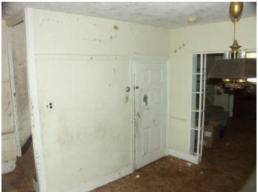
Photo 14. Room N1, north section, facing SW. Note stairs to the second floor (left), doorway to basement stairs (center).

Room N1, encompassing the eastern half of the north section, has a plastered ceiling and walls and a hardwood floor. The room measures 12'6"x15'6", although the southern three feet of the room is mostly occupied by the stairs. Key features of the room are the cheeked windows, baseboard molding, and the chair rail. Changes in the flooring under the carpet in the northwest corner indicate the size of the former hearth. An original door on the south wall opens into the stairs to the basement located directly under the stairs to the second floor. An original doorway on the east wall leads into the frame section; this doorway's architrave has the same paneling as the front door, and the door frame on the outside (now inside the kitchen) has the same double