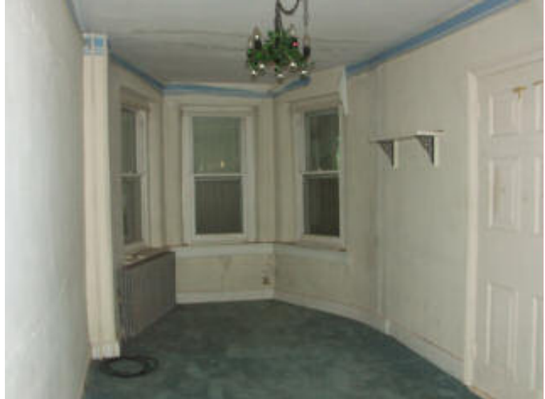
Photo 21. Room C4, center section, facing west into bay window.

The interior of the south section and the Connection are combined into one room (Photo 22). This space, measuring 21'6"x13'6", was highly altered. The fireplace was removed, the stairs reversed, and the flooring and joist system was replaced. The room has a plastered ceiling and a carpeted floor. Three of the walls are plastered; the eastern wall is covered with a diagonal wood siding stained a dark brown. The stairs to the second floor occupy the northeastern corner, with a storage space under the stairs. The room has two doors leading to the exterior and one into the apartment's kitchen.