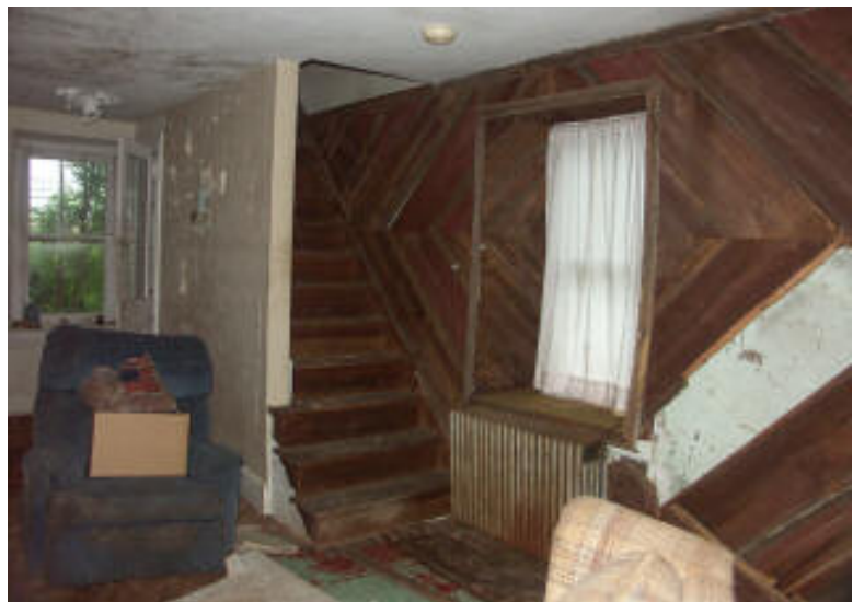
Photo 22. Interior of south section, facing NE. Note the diagonal wood treatment on the wall.