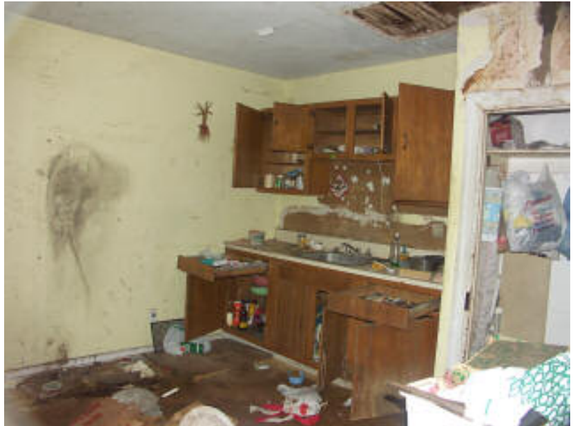
Photo 19. Room C2 in center section, facing NW.

Room C2 is located in the southeastern corner of the center section (Photo 19). This room was partitioned off from the center section as the kitchen for the south section apartment. It measures 11'x15'2". It has a plastered ceiling and walls and a vinyl floor. Cabinets and the sink are located on the northern wall, and the larger appliances were located along the western wall.