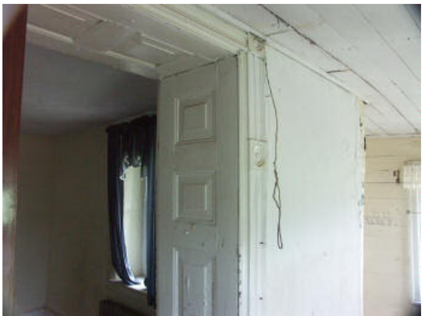
Photo 16. Detail of door surround and architrave between the north and frame sections.