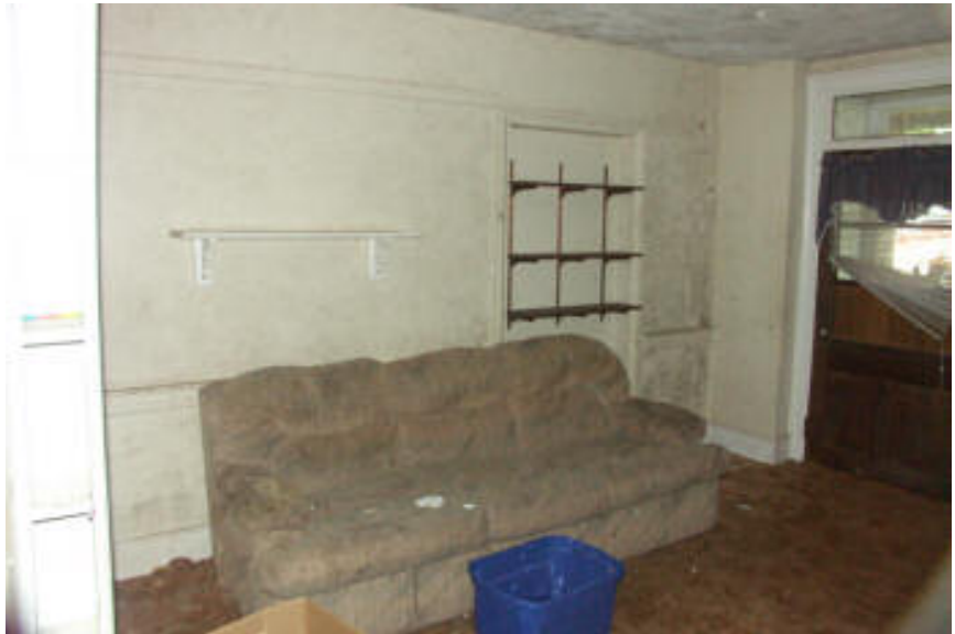
Photo 13. Room N2, North section, facing SW. Note the sealed door on south wall which originally connected to the center section.

The north section has two rooms on the first floor. The entrance on the west elevation opens into Room N2 (Photo 13), which measures 13'1"x15'6". This room has a plastered ceiling and walls and a carpeted floor. A sealed door is located on the south wall which formerly opened into Room C4 of the center section. The windows on the north and west walls feature "cheeking," or rounding of the jambs. One of the more important features of the room is the chair railing, which was used in other rooms historically but has been removed. The east partition wall has a centered doorway six feet wide leading into Room N1 (Photo 14). The doorway has a stack of five narrow shelves on the ends of the partition wall.