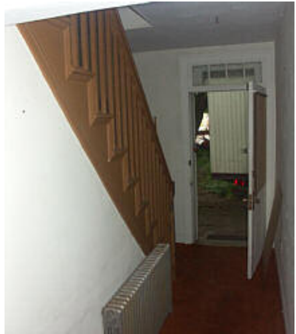
Photo 17. View of entryway, facing west.

The center section is divided into four large rooms (Rooms C1, C2, C3, and C4) and an entryway. Common elements in these rooms include a plastered ceiling and walls, tongue-and-grooved hardwood floors covered with carpeting, and a simple baseboard molding, with exceptions as noted below. The building's main entrance, located on the west elevation south of the bay window, opens into the entryway (Photo 17). This space, measuring 6'5"x11'3", includes a plainly designed stair system to the second floor along the entryway's southern wall and a narrow hallway running east to the kitchen. The stairs form part of a stair stack connecting all four levels of the house. The stairs have a pine newel post and square balusters. The entryway has a door opening south into Room C3 (probably the former parlor) and a door on the east end opening into Room C1 (the kitchen).