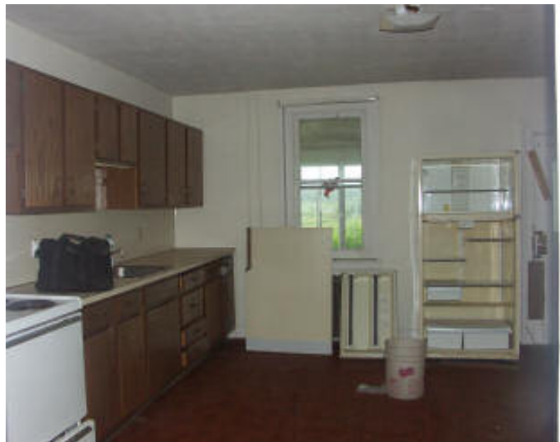
Photo 18. Room C1, showing kitchen appliances.

Room C1 is located in the northeast corner of the center section (Photo 18). It is a square room, measuring 14'10" on each side. This room served as the kitchen for the house and most recently for the middle apartment. It has a plastered ceiling and walls and has a vinyl floor. An L-shaped feature in the northwestern corner indicates the location of the plumbing stack and the remnants of the chimney. Three doors occupy most of the west wall of the room. The southernmost door opens into the stairs to the basement (under the formal stairs in the entryway). The center door opens into the entryway, and the northernmost door opens into Room C4. The southern wall historically had two doors, opening into Rooms C2 and C3.